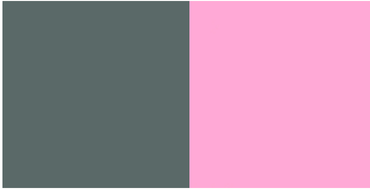
VERDIGRIS/POM-POM - 3582