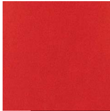
HOT - 3371